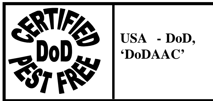
Figure AP3.F1. DoD “Pest Free” Certification Mark

DoD “Pest Free” Certification Marking. Certification and application of the DoD “Pest Free” certification marking (see Figure AP3.F1) is authorized if the material successfully passes the established moisture and visual inspection standards (see paragraph AP3.2.) and has a valid date of pack prior to December 31, 2007. The DoD “Pest Free” certification mark shall display the letters “DoD,” the words “Certified Pest Free,” and the DODAAC of the packaging or shipping activity. The DODAAC provides identification. (See Figure AP3.F1.)